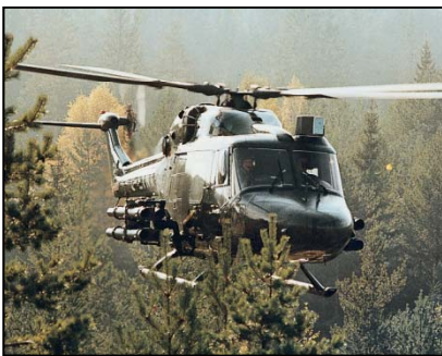
Lynx Helicopter armed with TOW missiles