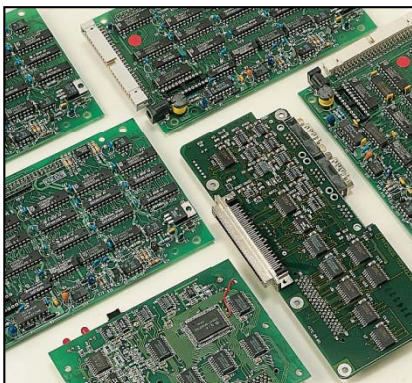
Circuit boards for computerised data logging system