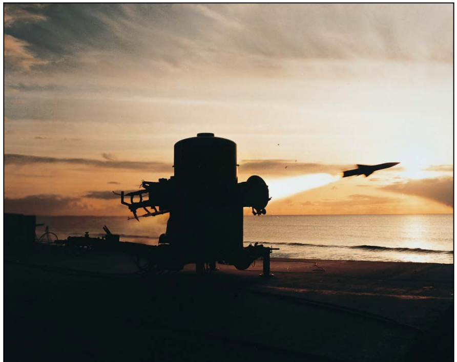
Rapier missile launch