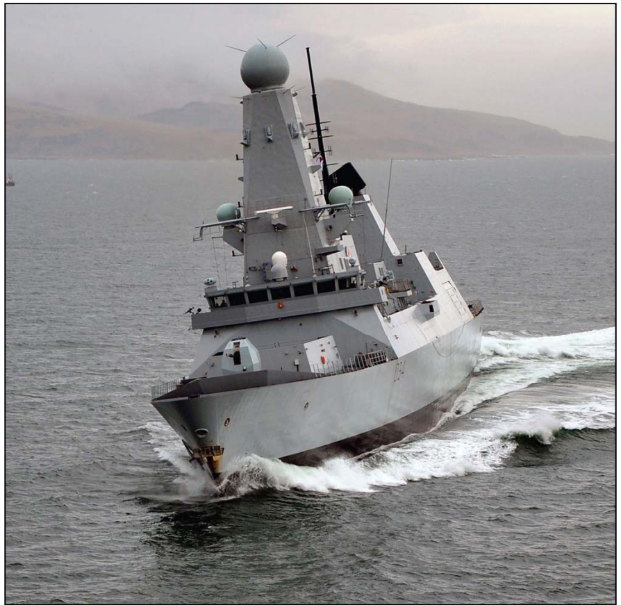
U.K. Royal Navy HMS Diamond Type 45 destroyer