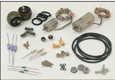
Part of a missile system spare parts package