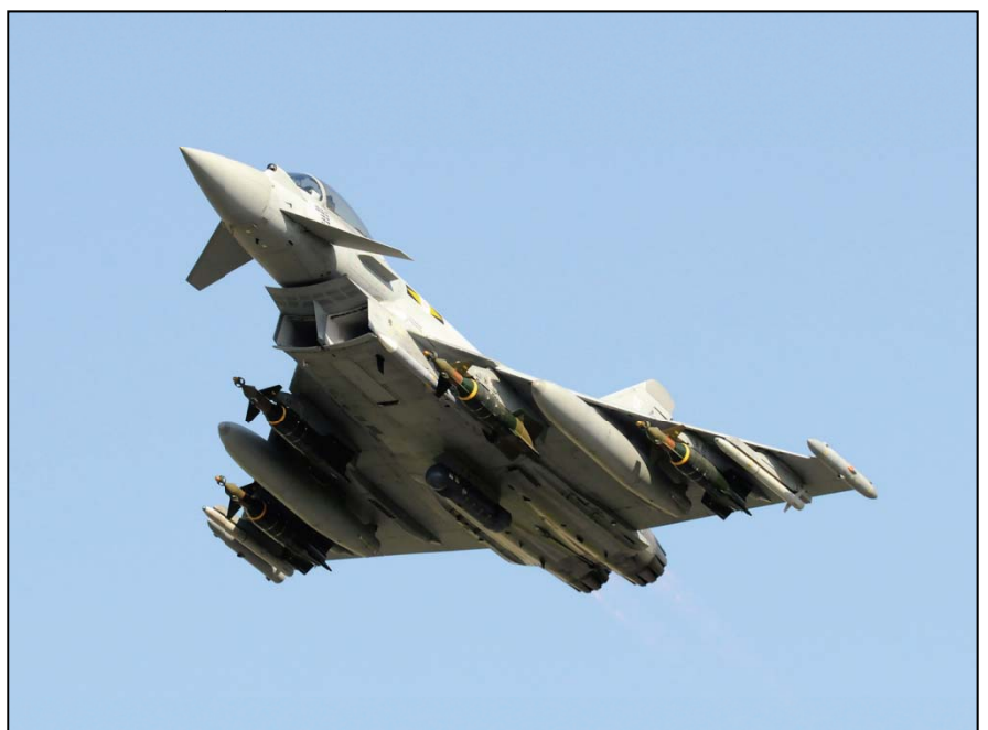
U.K. Royal Air Force Typhoon