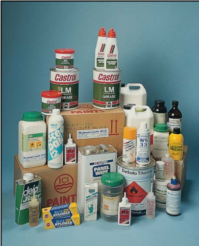
Specialised Paints, Sealants, Adhesives and Lubricants etc. supplied by Repaircraft

Repaircraft supply parts and systems for all types of Aircraft, Helicopters, Missiles, Armaments, Avionics Equipment, Surveillance Equipment, Ground Support Equipment, Training Simulators etc.