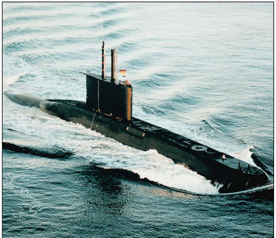
Type 209 Submarine