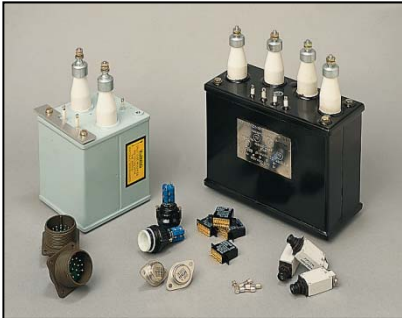
Oil filled shock resistant transformers and various electrical components for a naval radar maintenance project

Repaircraft supply parts and systems for all types of Ships, Submarines, Hovercraft, Patrol Boats, Torpedoes, Mines, Missiles, Armaments, Radar, Sonar, Diving Equipment, Mechanical Handling Equipment etc.