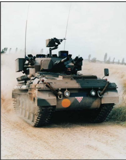
Scorpion light tank