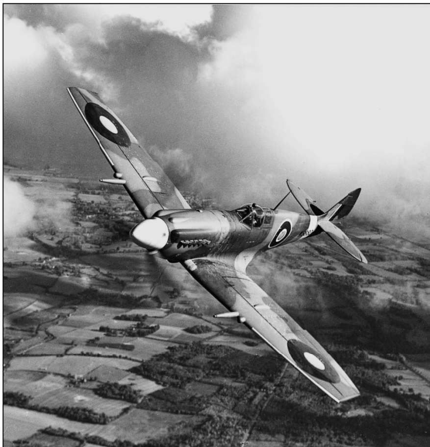
Spitfire MK XII as supported by Repaircraft in the 1940's

In short, by combining our staff of highly trained and experienced researchers, engineers, buyers and quality assurance inspectors, together with a highly sophisticated and fully integrated computer operations and management system Repaircraft are able to offer total support.