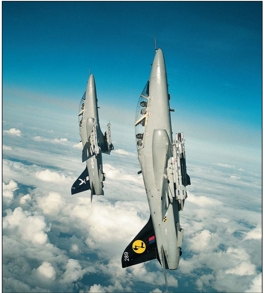
U.K. Royal Air Force Hawk