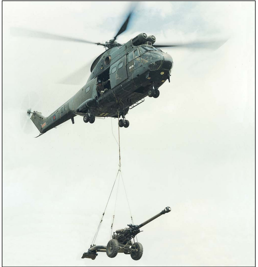
105mm Light gun being transported by a Puma helicopter