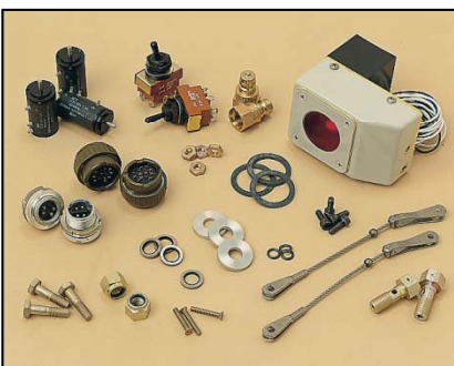
Selection of components from a Repaircraft modification/upgrade project