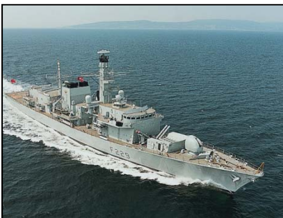
Type 23 frigate