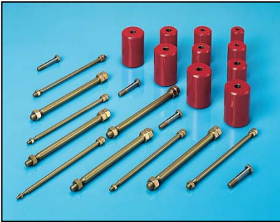
Service Kit manufactured for 155mm howitzer

Repaircraft supply parts and systems for all types of Fighting Vehicles, Missile Launchers, Artillery, Bridging Equipment, Transporters, Trucks, Trailers, MRAP Vehicles, Refuellers, Generators, Communications Equipment, Surveillance Equipment etc.